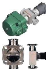
Dual Flow and Bypass