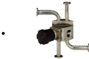
Sterile Barrier, Block and Bleed Valve