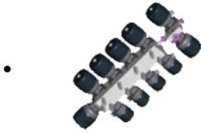
Custom Block Designs