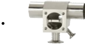
Zero Static Back to Back Sample Valve