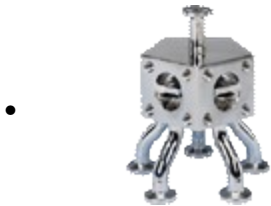
Multiport Divert Valves