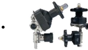
Sterile Access and GMP Valve