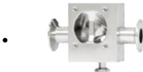
Integral Sterile Access Valves