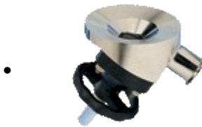
Tank Bottom Valve