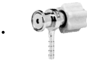
Sample and Bleed Valve