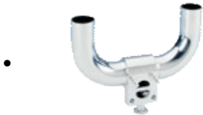
Zero Static Block Body