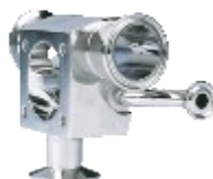
Zero Static Down Stream Purge