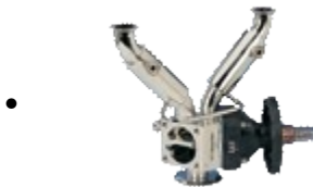
Sterile Filter Shunt Valve