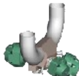
Zero Static with Upstream Sample & Downstream Purge